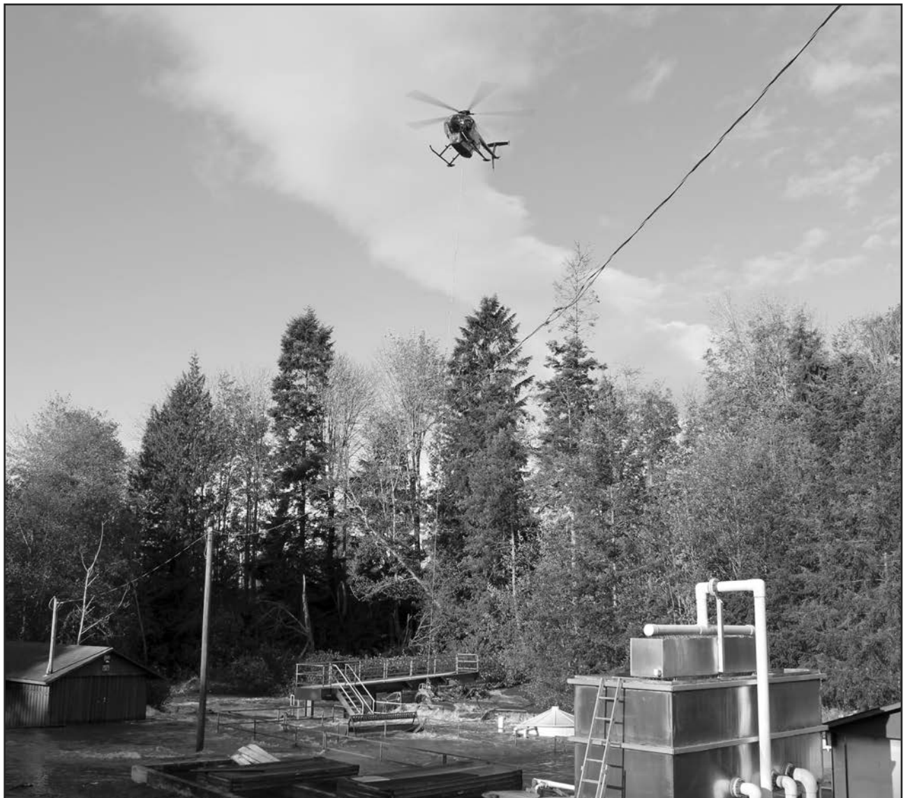
Helicopter assists with debris removal during recent flooding of the Hatchery

Land: Tla'amin Convenience store lease and details on the working agreement and setting the basic rent amount was discussed. A point on the land designation was queried. Land was designated previously as commercial property but it will need checking to determine if it is designated as leasable in the land registry. Chief and Council endorse entering into the lease, however further analysis and due diligence is required before signing off on it. A Councilor mentioned other businesses that will be started in the