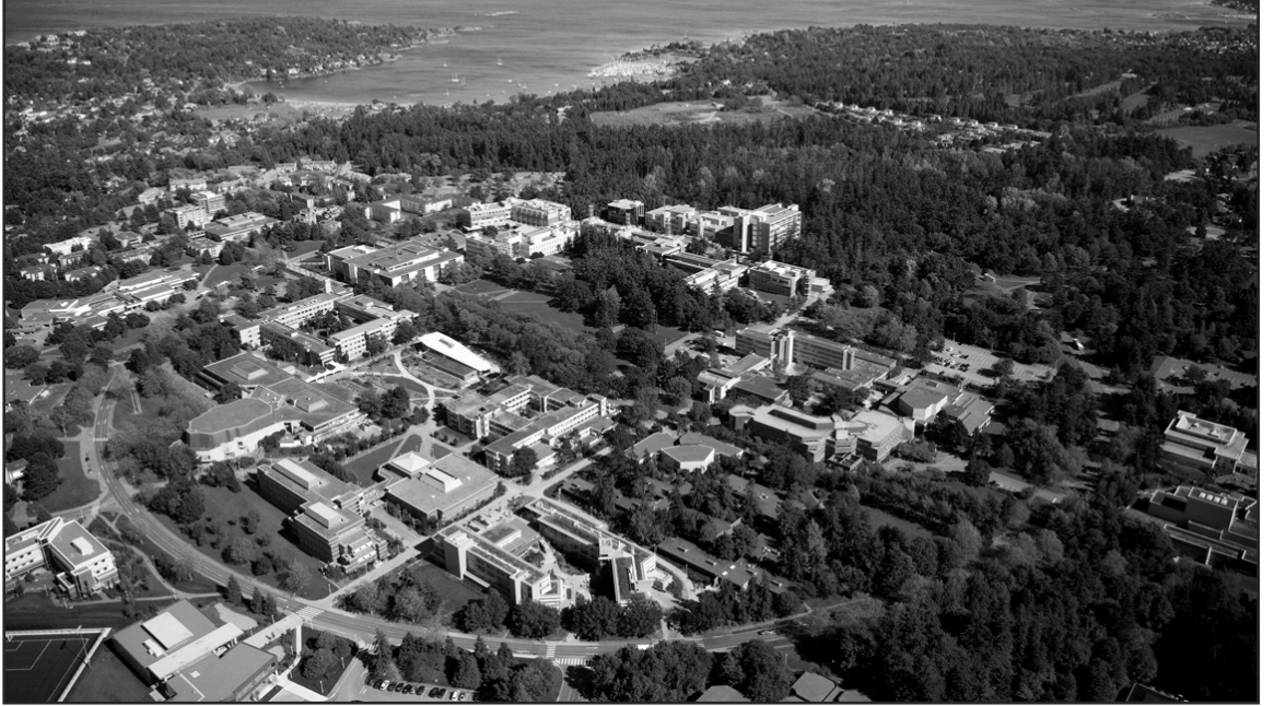
UVIC: University of Victoria