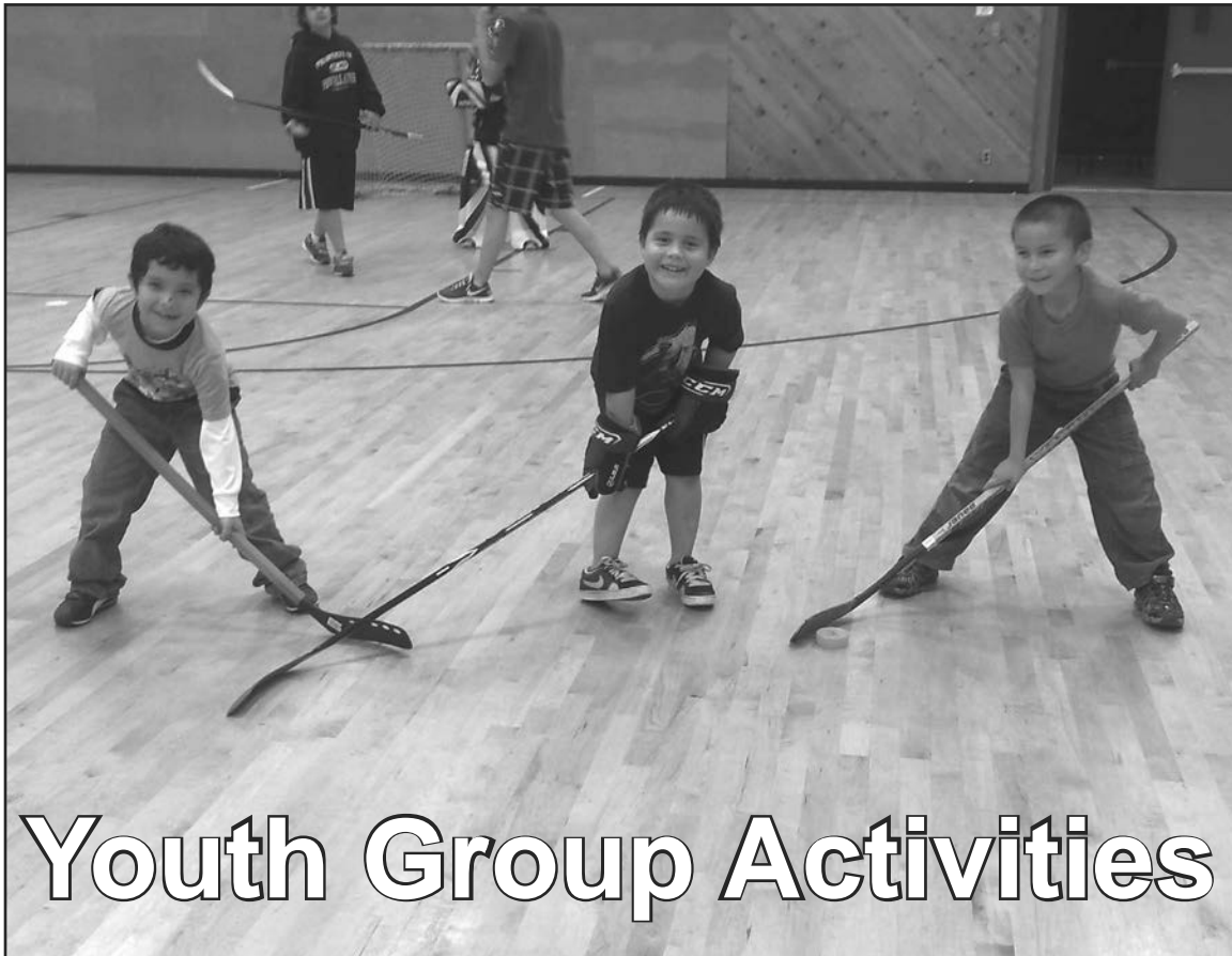
Youth Group Activities