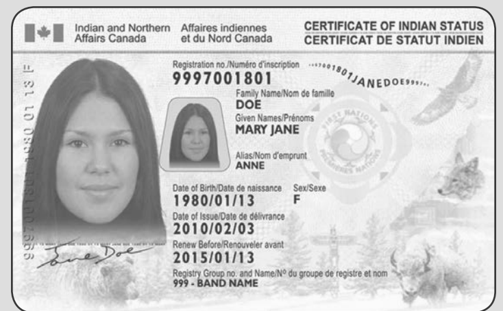
New Secure Certificate of Indian Status