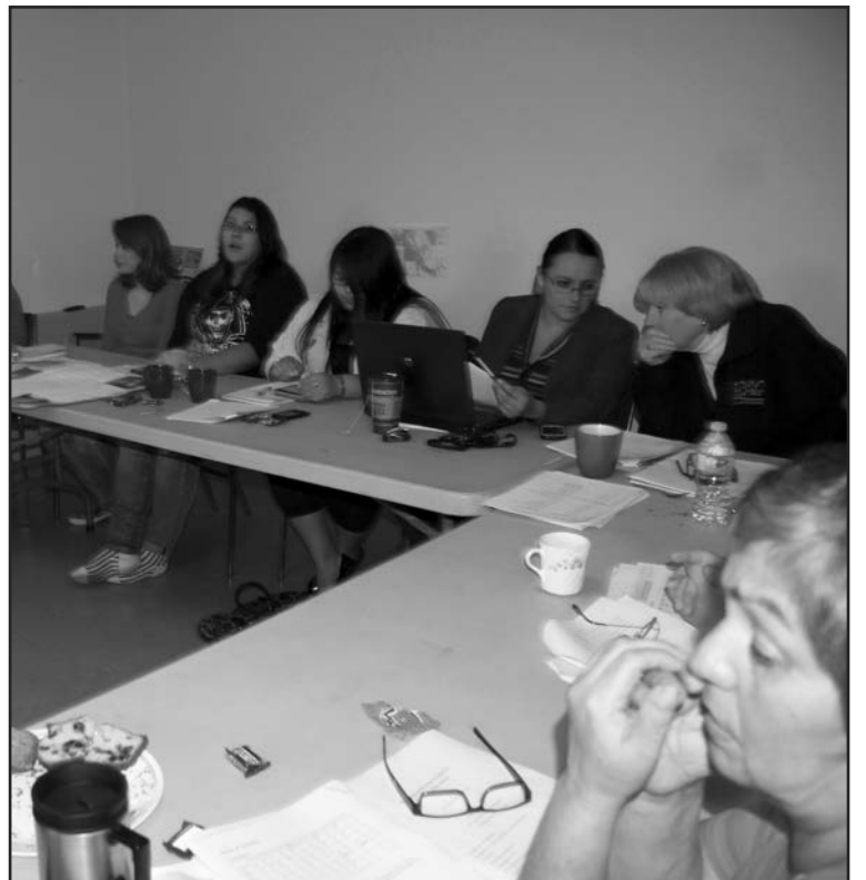
It is time to come together and remember