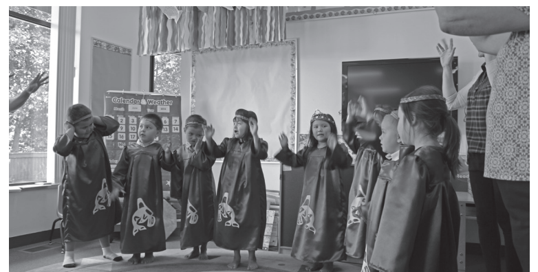
Preschool graduation 2014