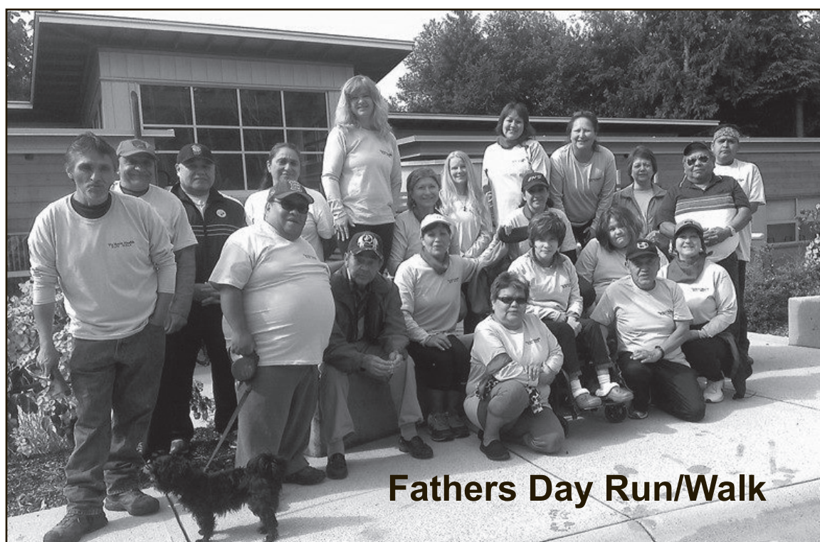
Fathers Day Run/Walk