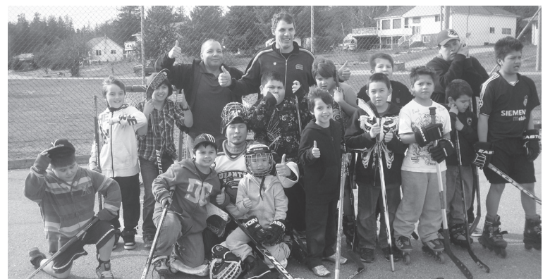
Gino Odjick visits Sliammon in 2011 "DON'T STOP BELIEVING"